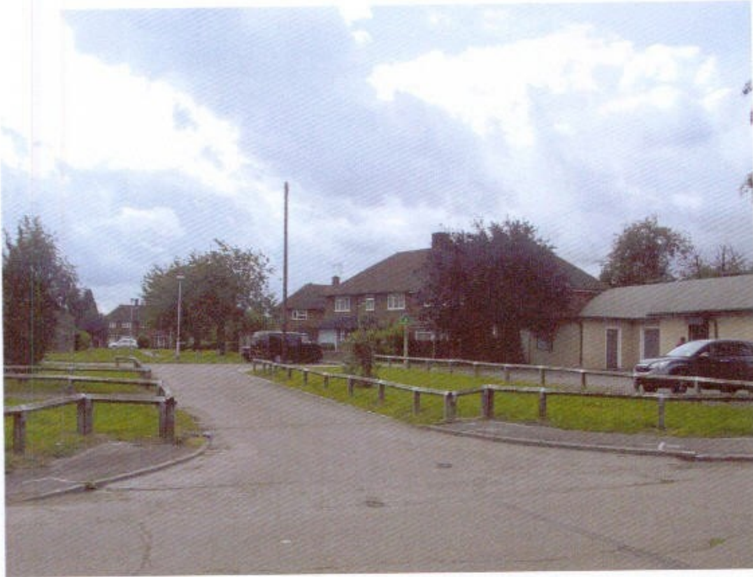
View of the cul-de-sac to the east of the site. The site is on the right. The Baptist church is to the left of the picture.