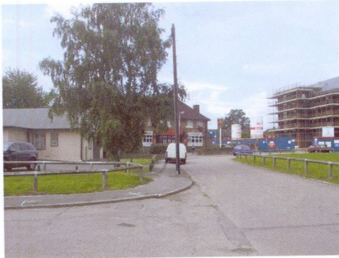
View of the site looking west along School Mead. The site and existing Hall are to the left of the picture. The Breakspeare Public House is in the centre. The local shopping facilities (under construction) in the background and public open space in the foreground are to the right.