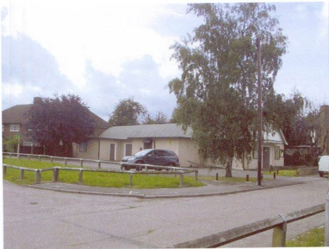
View of the site with the existing building looking south-west