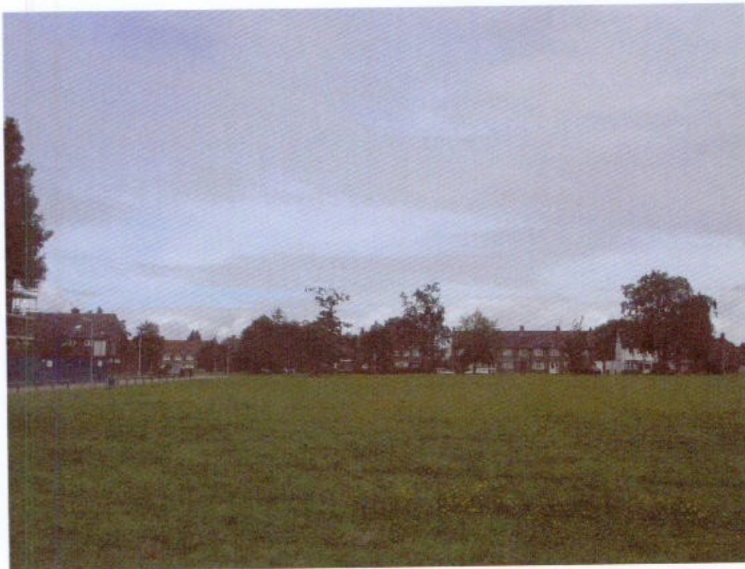
View looking north from the site across the public open space