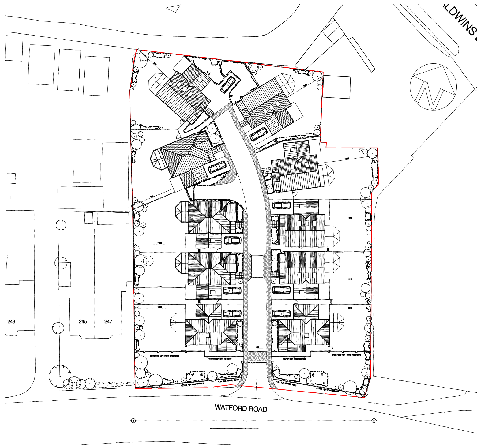
Block plan 1:500