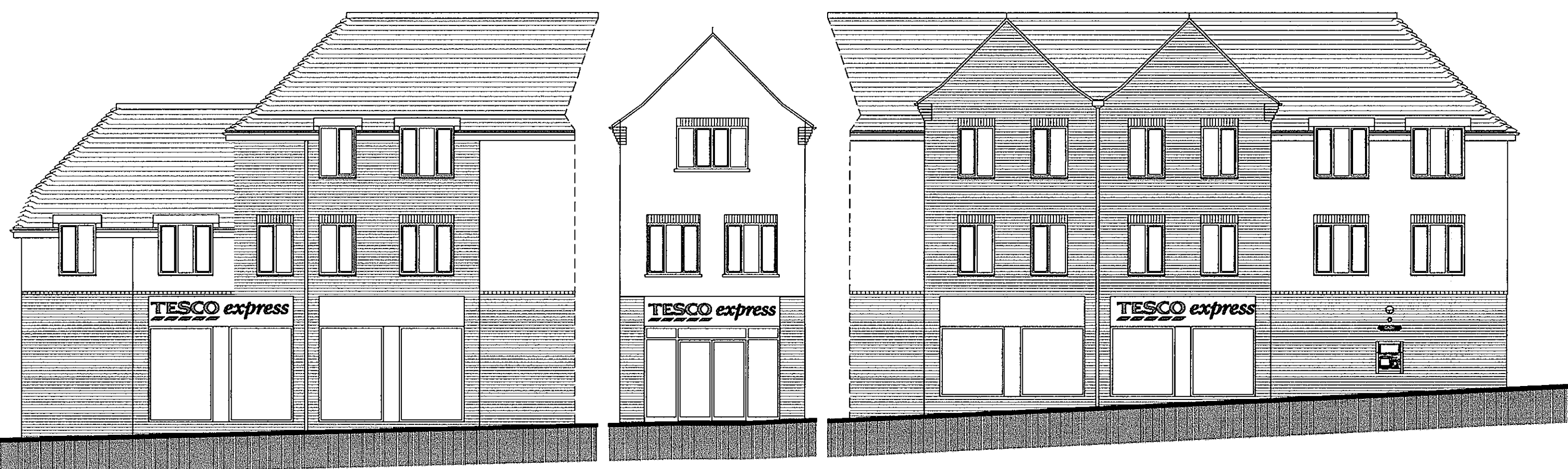
Proposed South-East Elevation (B)